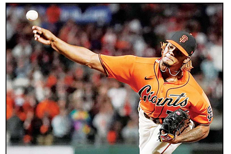
San Francisco Giants' Camilo Doval pitches against the San Diego Padres during the ninth inning of a baseball game in San Francisco, on Oct 1.

One night after clinching their fourth straight division title, the Braves played