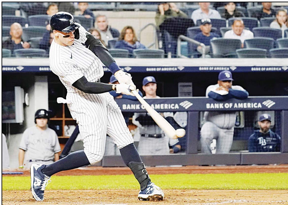
New York Yankees' Aaron Judge singles in the sixth inning of a baseball game against the Tampa Bay Rays, on Oct 1, in New York.

Rays reliever Andrew Kittredge allowed Giancarlo Stanton's one-out double and a bunt RBI single by Joey Gallo. Brett Gardner followed by singling home a run before Kittredge fanned Sánchez and Odor for his eighth save.