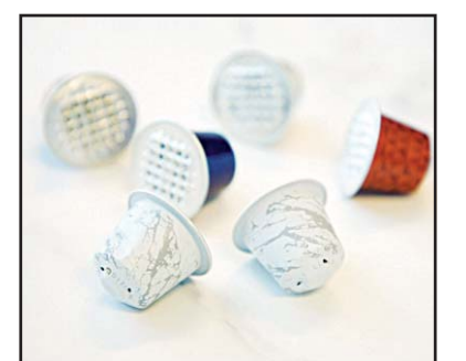
Used coffee capsules.

Indeed, the used capsules were collected in a dedicated box placed in the lobby of the authority building. Al-Matar added that drinking coffee is a very common habit in Kuwaiti society, as we see coffee machines in homes, work and various places, and they are used all the time, pointing to the authority's cooperation with one of the international coffee companies located in Kuwait and coordinating with factories specialized in recycling, as the existing aluminum will be extracted in capsules, recycle it and use it again.