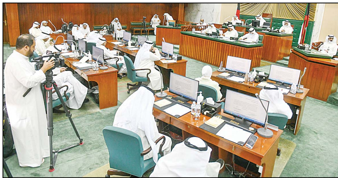
Municipal Council session in progress.

SACGC praises Kuwait winning 2 prizes in Future Science Challenge