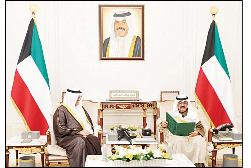
HH the Crown Prince receives the ambassador of the Custodian of Two Holy Mosques.

He pointed out that the Future Science Challenge competition aimed to enhance the learning of the principles of artificial intelligence and the Internet of Things by focusing on interdisciplinary learning methods for talented and outstanding students in the field of science and technology.