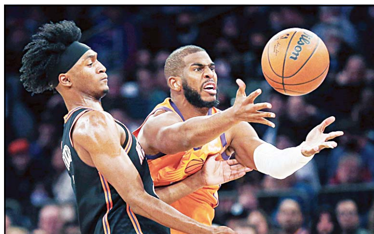
New York Knicks' Immanuel Quickley (5) and Phoenix Suns' Chris Paul (3) battle for the ball during the second half of an NBA basketball game in New York. The Suns won 118-97.