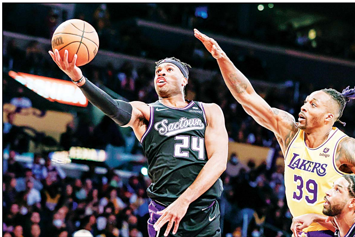
Sacramento Kings guard Buddy Heild (24) goes to basket while defended by Los Angeles Lakers center Dwight Howard (39) during the second half of an NBA basketball game in Los Angeles. The Kings won 141-137 in triple overtime.