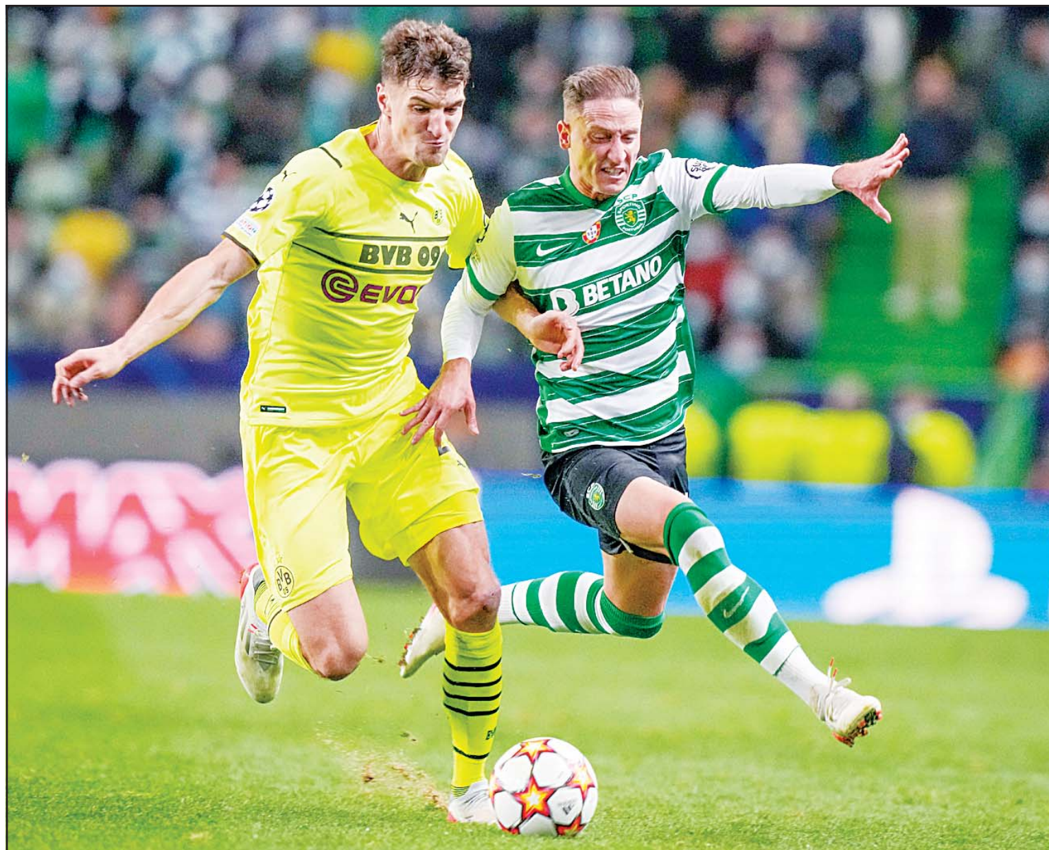
Dortmund's Thomas Meunier (left), Sporting's Nuno Santos compete for the ball during a Champions League Group C soccer match between Sporting CP and Borussia Dortmund at the Alvalade stadium in Lisbon, Portugal.