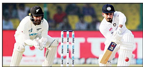
India's Shreyas Iyer plays a defensive shot during day one of their first Test cricket match with New Zealand in Kanpur, India.