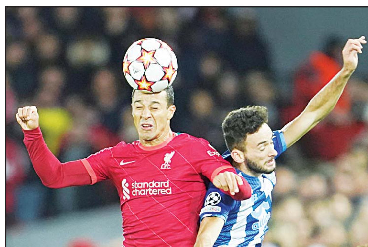
Liverpool's Thiago (left), heads the ball past Porto's Joao Mario during the Champions League group B soccer match between Liverpool and FC Porto at Anfield stadium in Liverpool.