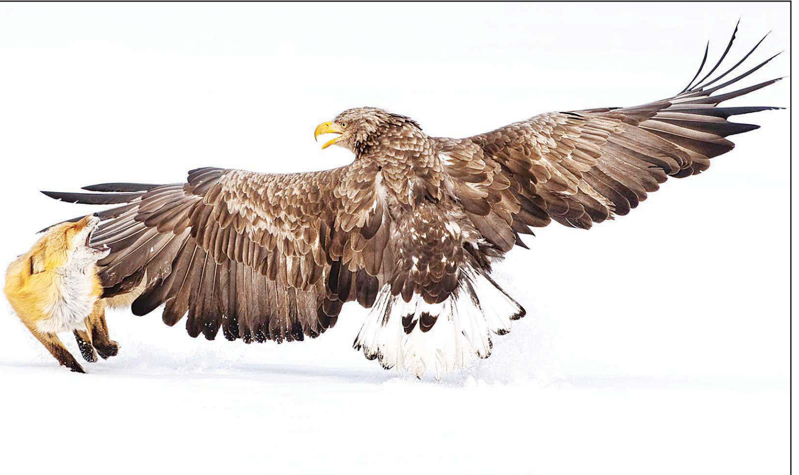
The second-placed winning photo by Kuwaiti photographer Fahad Al Enzei.

The protesters, mostly members of left-wing groups, were starting to gather in Istanbul's Kadikoy district, located on the Asian side of the city, when police intervened. Demonstrators were chanting slogans calling for President Recep Tayyip Erdogan's government to resign. (AP)