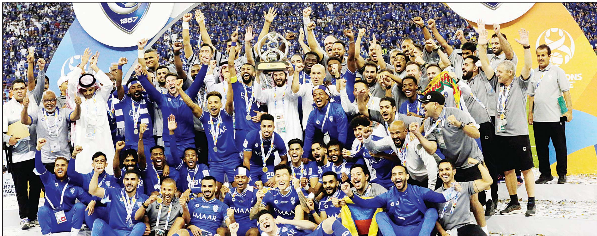
Saudi Arabia's Al-Hilal soccer team celebrate with the trophy of the AFC Champions League 2021 after the team beat South Korea's Pohang Steelers 2-0 during their final match at the King Fahd International Stadium in Riyadh, Saudi Arabia.

Latest sports scores at — http://sports.arabtimesonline.com