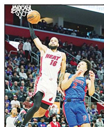
Miami Heat forward Caleb Martin (16) makes a layup as Detroit Pistons guard Cade Cunningham (2) defends during the second half of an NBA basketball game in Detroit.

32 points and Portland handed the banged-up Denver Nuggets their fifth straight loss.