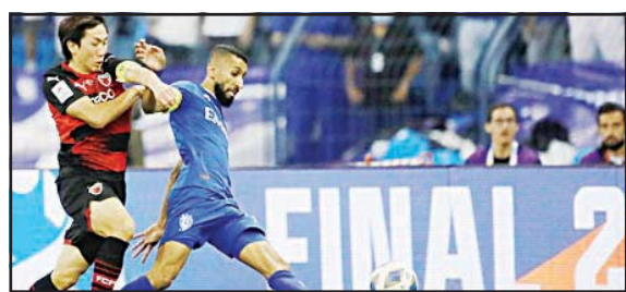
South Korea's Pohang Steelers player Kang Sang-woo (left), fights for the ball with Saudi Arabia's Al-Hilal player Salman Al-Faraj during their final soccer match of the AFC Champions League 2021 at the King Fahd International Stadium in Riyadh, Saudi Arabia.