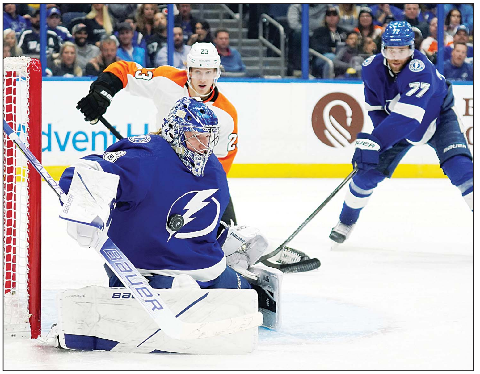
Tampa Bay Lightning goaltender Andrei Vasilevskiy (88) makes a save in front of Philadelphia Flyers left wing Oskar Lindblom (23) during the third period of an NHL hockey game, on Nov 23, in Tampa, Fla.

Vasilevskiy made a nifty first-period glove save on Claude Giroux's left-circle shot. The 2021 Conn Smythe Trophy winner as the playoffs MVP has a 199-86-22 career record. It was his first shut-out this season and 27th overall.