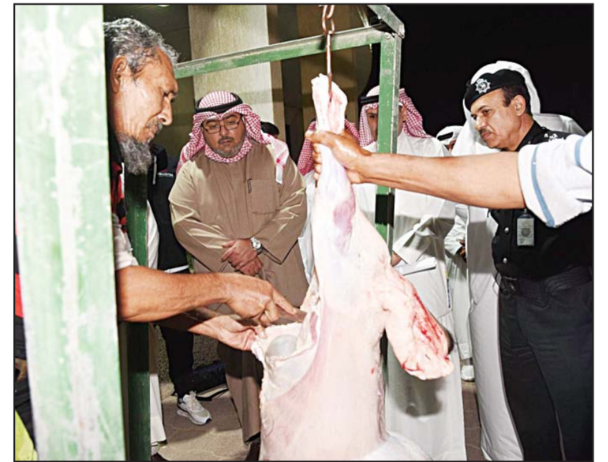
The Minister of Interior Sheikh Thamer Ali Sabah Salem Al-Sabah looks on as drugs are retrieved from the guts of a sheep after slaughtering it.

The General Administration of Relations and Security Media stated that the Minister of Interior affirmed his confidence in the anti-narcotics men and their ability to keep pace with the modern and innovative criminal methods of drug smuggling, stressing that the Ministry of Interior employees will remain the impenetrable barrier in the face of anyone who seeks to harm the security of the homeland and the safety of citizens and residents.