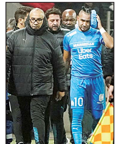
Marseille's Dimitri Payet (right), is surrounded by his staff as he leaves the field after being injured by an object thrown by a Lyon supporter during the French League One soccer match between Lyon and Marseille, in Decines, near Lyon, central France, on Nov. 21.