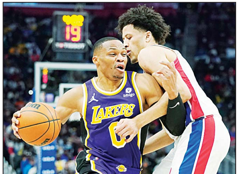
Los Angeles Lakers guard Russell Westbrook (0) is defended by Detroit Pistons guard Cade Cunningham during the first half of an NBA basketball game, on Nov. 21, in Detroit.