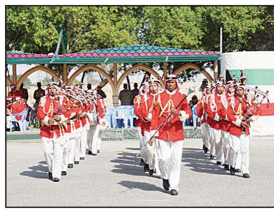
Top and above: some photos from the celebration of the Armed Forces Day.