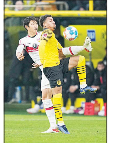
Stuttgart's Hiroki Ito, (left), and Dortmund's Donyell Malen challenge for the ball during the German Bundesliga soccer match between Borussia Dortmund and VfB Stuttgart in Dortmund, Germany.

It was only Augsburg's third win in 21 league games against its powerful southeastern neighbor, which fell to its second defeat of the season. Bayern had won 16 of their previous 20 meetings.