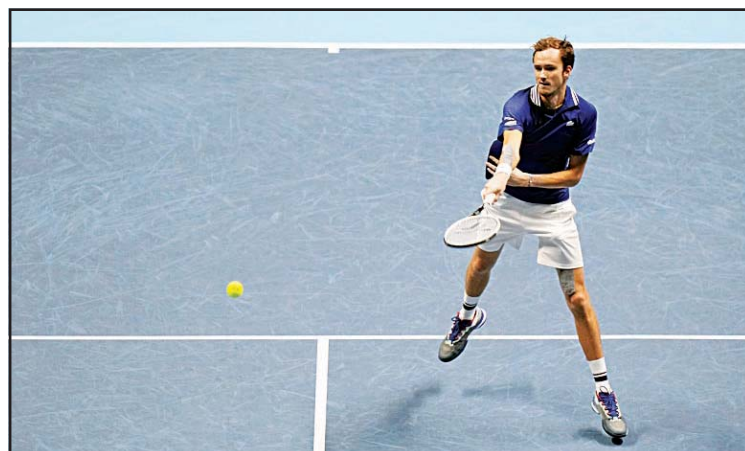
Daniil Medvedev of Russia returns the ball to Casper Ruud of Norway during their ATP World Tour Finals, singles semifinal, tennis match, at the Pala Alpitour in Turin, Italy.

Medvedev didn't face a single break point and won 11 of 15 points at the net.