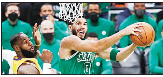
Boston Celtics' Jayson Tatum (0) goes up to shoot against Los Angeles Lakers' LeBron James, (left), during the first half of an NBA basketball game in Boston.