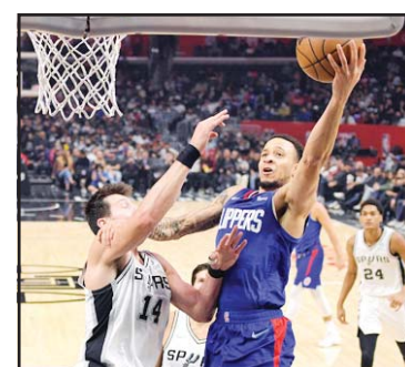
Los Angeles Clippers guard Amir Coffey (right) shoots as San Antonio Spurs forward Drew Eubanks defends during the first half of an NBA basketball game, on Nov. 16, in Los Angeles.

his second triple-double since Sunday, leading the Spurs with 26 points, 12 rebounds and nine assists.