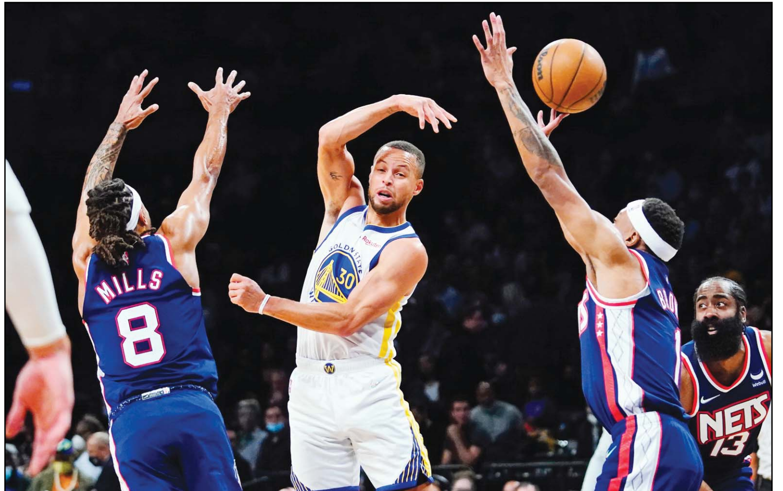
Golden State Warriors' Stephen Curry (30) passes away from Brooklyn Nets' Patty Mills (8) and Bruce Brown (1) during the first half of an NBA basketball game, on Nov. 16, in New York.