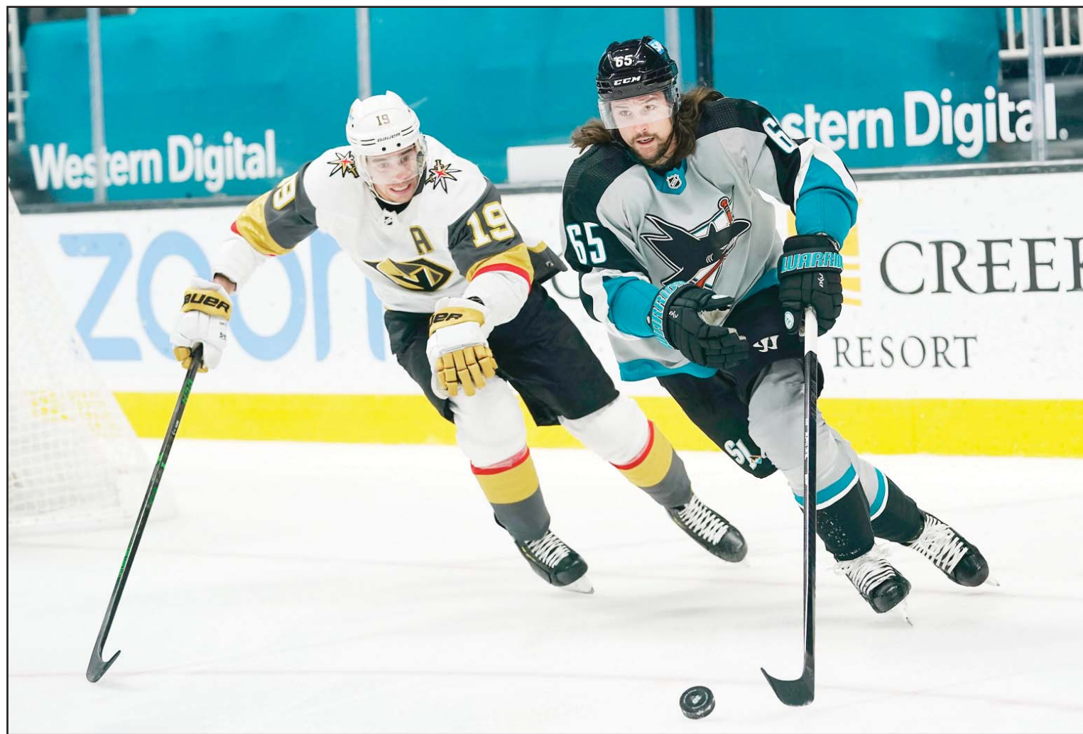
San Jose Sharks defenseman Erik Karlsson (right), skates in front of Vegas Golden Knights right wing Reilly Smith (19) during the second period of an NHL hockey game in San Jose, Calif., March 6.