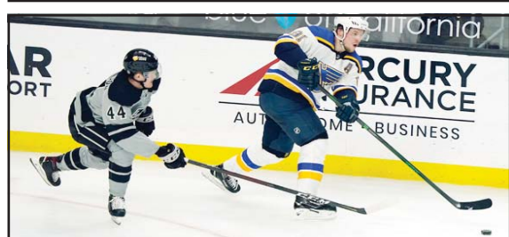
St. Louis Blues right wing Vladimir Tarasenko (right), passes in front of Los Angeles Kings defenseman Mikey Anderson (44) during the second period of an NHL hockey game, March 6, in Los Angeles.