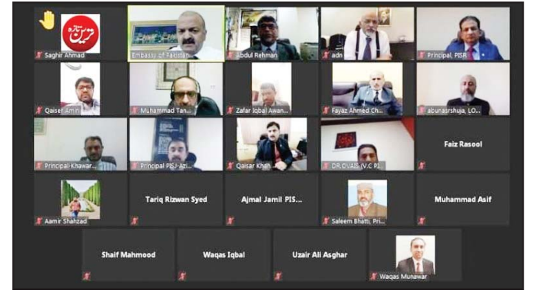
A screen shot from the online meeting.

HE the ambassador stressed on the importance of close liaison between the Embassy of Pakistan in Riyadh, respective BoDs and principals of schools to assert all their possible positive energies for the best welfare of students and academic environ-