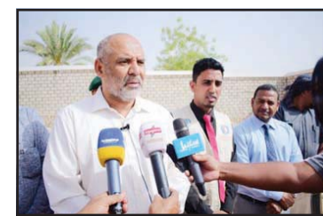
Issam Al-Kathiri, Undersecretary of Hadhramaut.

The enterprise will secure schooling for 300 students.