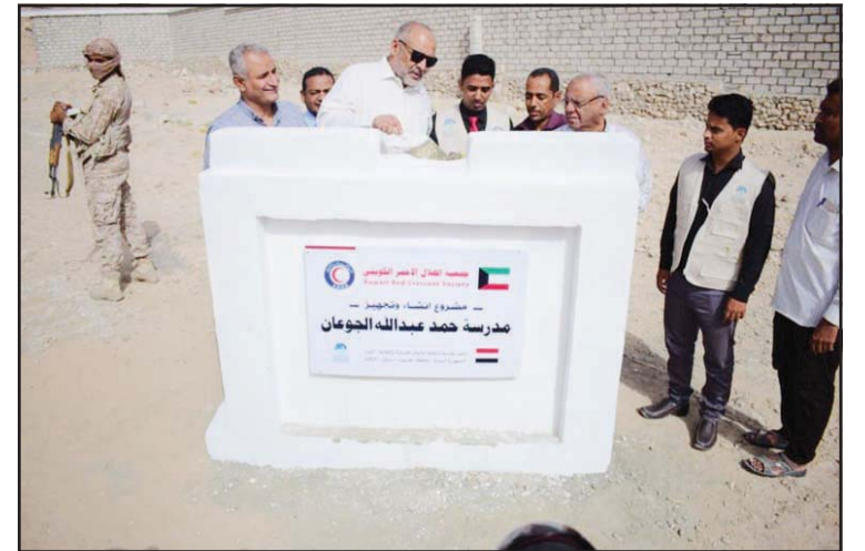
Cornerstone for Kuwait-funded school laid in Yemen.