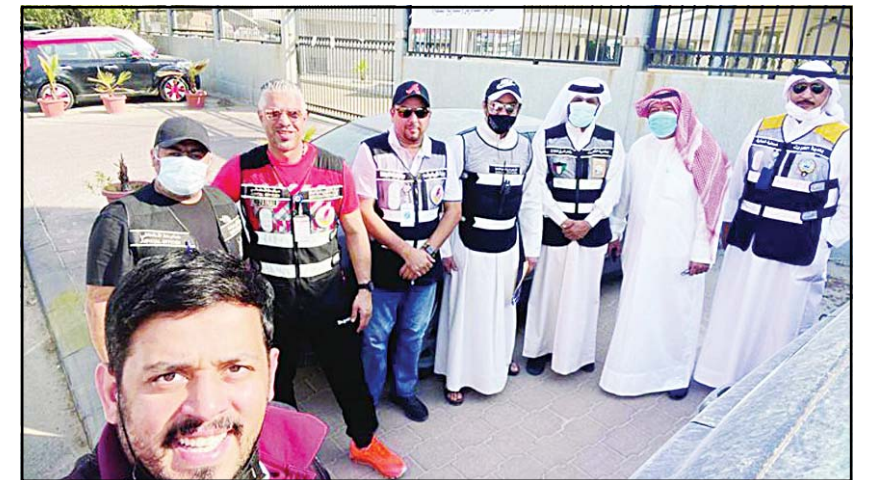
Members of the judicial police team during the campaign.

His Highness the Prime Minister Sheikh Sabah Khaled Al-Hamad Al-Sabah sent a similar cable.