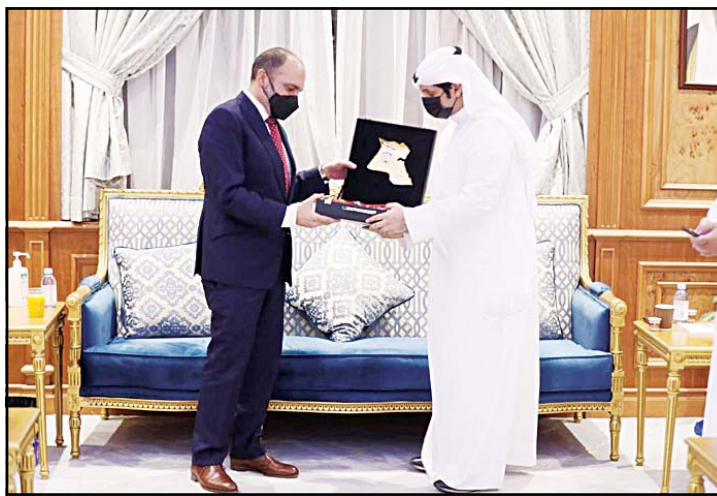
Minister Al-Mutairi and Prince Ali bin Al Hussein exchange memorial shields.

The meeting was attended by the head of the Kuwait Football