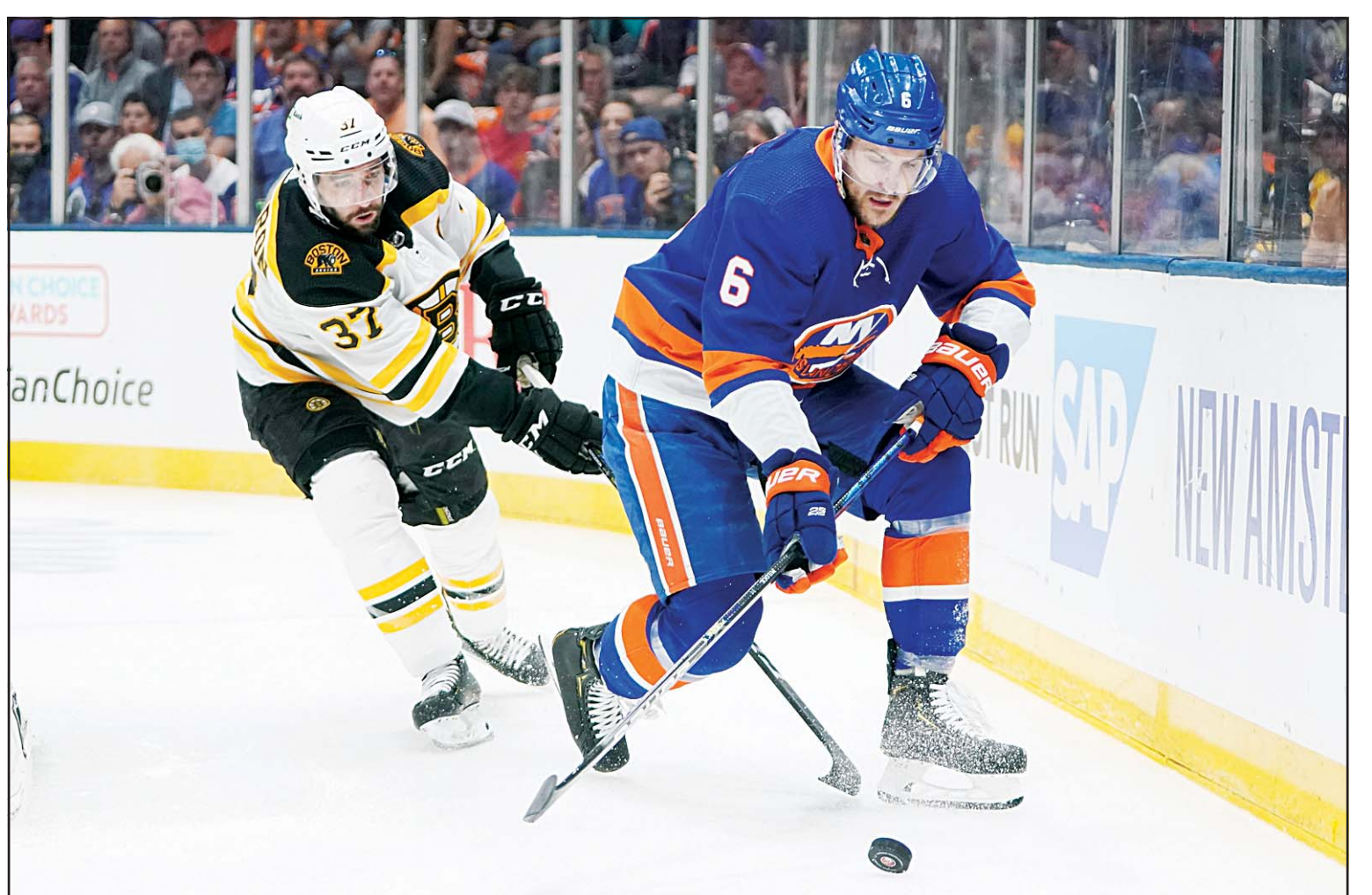
Boston Bruins' Patrice Bergeron (37) fights for control of the puck with New York Islanders' Ryan Pulock (6) during the first period of Game 6 during an NHL hockey second-round playoff series, on June 9, in Uniondale, N.Y.