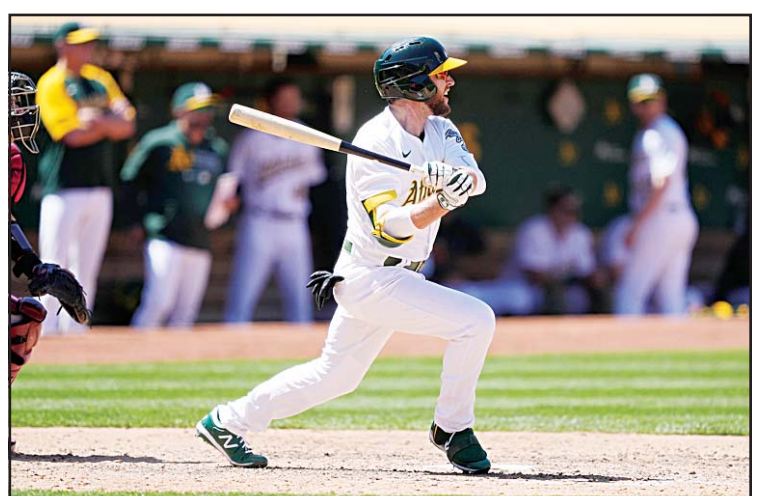
Oakland Athletics' Jed Lowrie hits a single against the Arizona Diamondbacks during the seventh inning of a baseball game, on June 9, in Oakland, Calif.

Grichuk hit a 451-foot drive leading off the second inning. Toronto rookie Alek Manoah threw five solid innings in his third major league start and the Blue Jays won despite another strong start by Chicago's Lance Lynn.