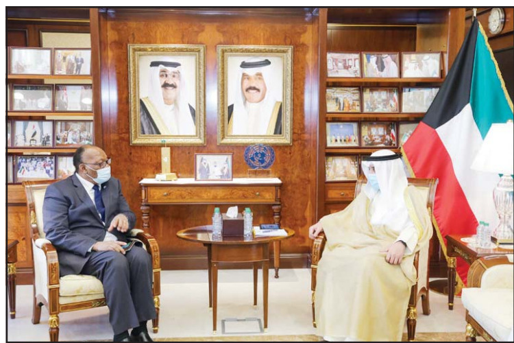
Foreign Minister and Minister of State for Cabinet Affairs Sheikh Dr Ahmad Nasser Al-Mohammad Al-Sabah receives envoys.