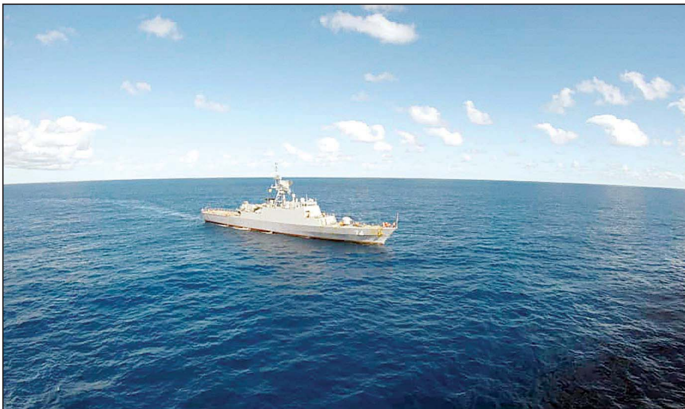
In this photo released June 10, by the Iranian army, an Iranian warship moves in the Atlantic Ocean. Iran has dispatched two warships to the Atlantic Ocean, a rare mission to demonstrate the country's maritime power, state TV reported Thursday, without specifying the vessels' final destination.

On the talks involving Palestinian leaders and Egyptian officials in the capital Cairo that aim to solidify a truce with Israel, he said an end to Israel's "abusive practices" is the proviso needed to push for constructive dialogue.