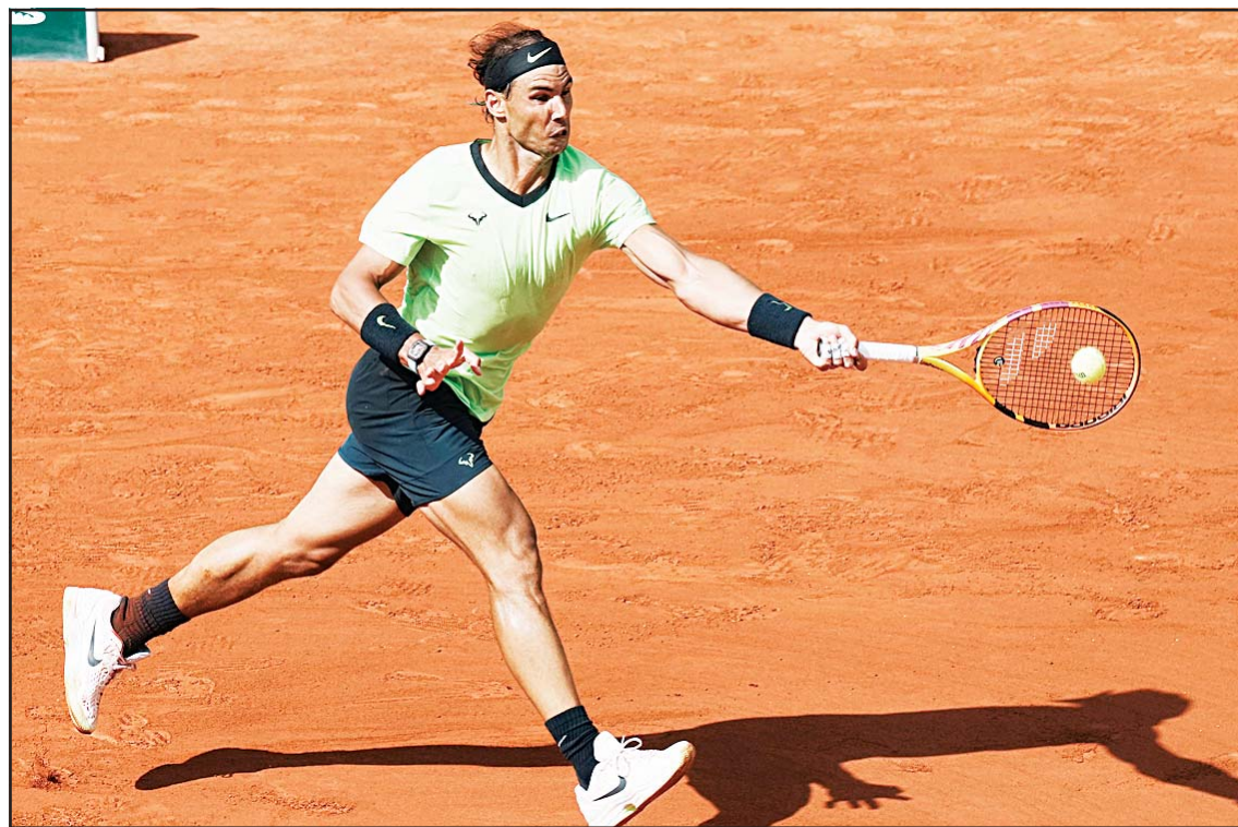
Spain's Rafael Nadal plays a forehand to Argentina's Diego Schwartzman during their quarterfinal match of the French Open tennis tournament at the Roland Garros stadium in Paris.

Colombia hold Argentina in S. American WC qualifying