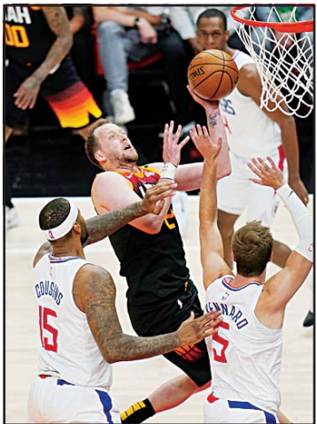
Los Angeles Clippers' DeMarcus Cousins (15) and Luke Kennard (5) defend against Utah Jazz guard Joe Ingles during the first half of Game 1 of a second-round NBA basketball playoff series in Salt Lake City.

Milton buried a long-distance 3 to send the Sixers into the fourth quarter with a 91-84 lead. He kept it going with a jumper early in the fourth that made it 95-84.