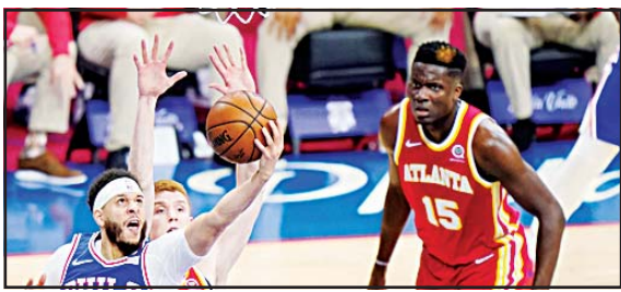
Philadelphia 76ers' Seth Curry, (left), goes up for a shot against Atlanta Hawks' Kevin Huerter and Clint Capela during the first half of Game 2 in a second-round NBA basketball playoff series in Philadelphia.