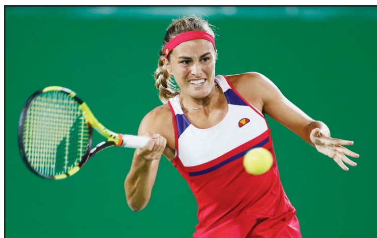
In this Aug. 13, 2016 file photo, Monica Puig, of Puerto Rico, returns to Germany's Angelique Kerber in the gold medal match of the women's tennis competition at the 2016 Summer Olympics in Rio de Janeiro, Brazil.