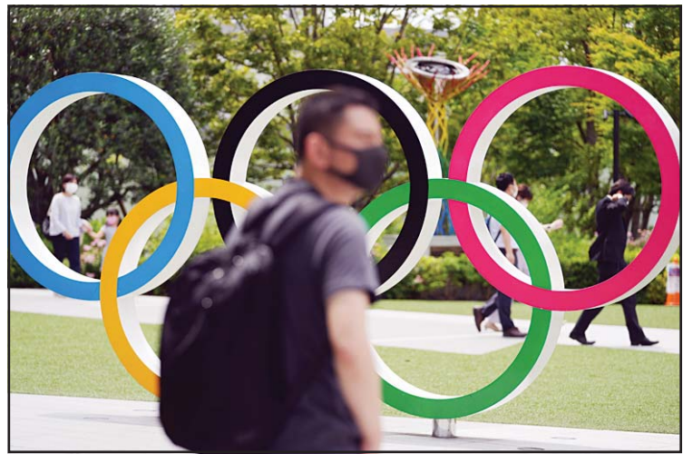
People walk near the Olympic Rings, on June 2, in Tokyo.