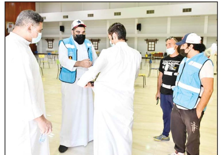
A civil defense team seen following up the procedures for organized entry of students to conduct swab tests.