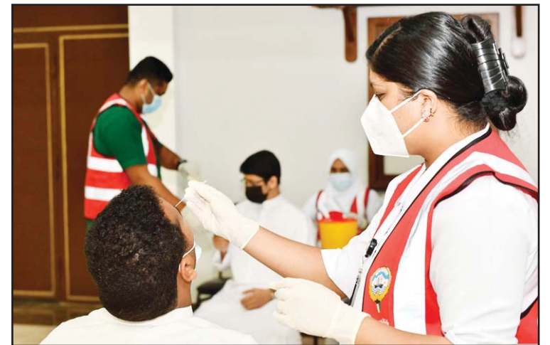
PCR swab test being done on a student

The free swab test was conducted from 8:00 am until 8:00 pm, knowing that entering the tests requires submitting a certificate of vaccination against the emerging virus issued by the Ministry of Health, or through an immunity application, or a negative PCR examination certificate issued by the Ministry of Health.