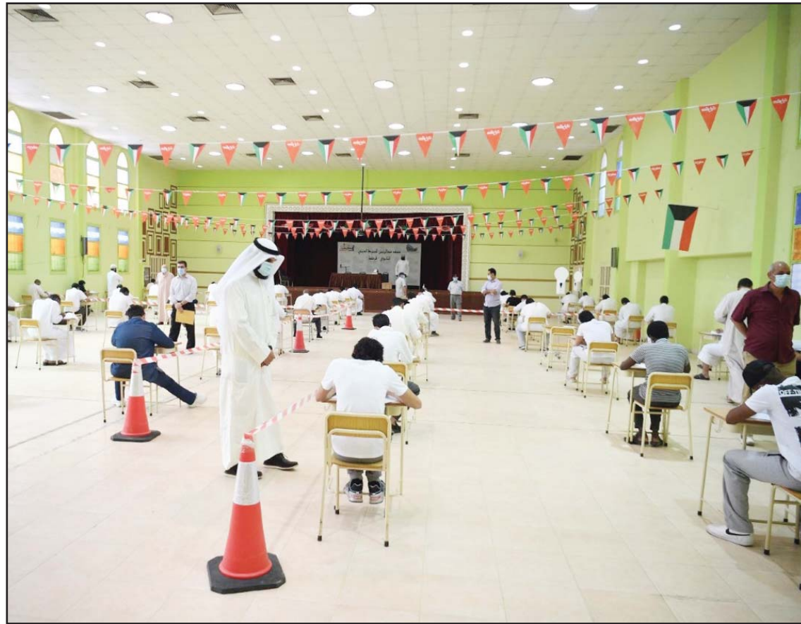
Exams for 12th grade students begin in religious education institutes.