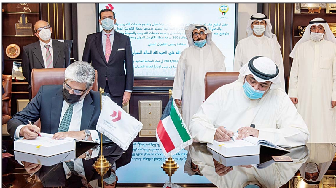
Top: DGCA and Indra officials pose for a group photo, and (above) signing of the contract to provide devices to operate the new control tower at Kuwait airport.