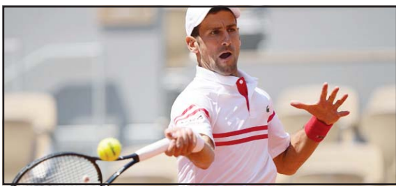
Serbia's Novak Djokovic plays a return to Italy's Lorenzo Musetti during their fourth round match on day 9, of the French Open tennis tournament at Roland Garros in Paris, France.