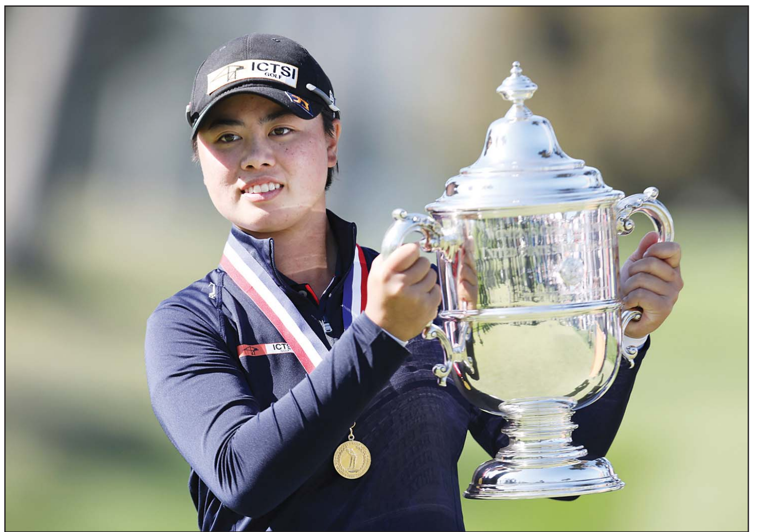
Yuka Saso, of the Philippines, celebrates her victory during the final round of the U.S. Women's Open golf tournament at The Olympic Club in San Francisco. Saso defeated Nasa Hataoka, of Japan, in a three-hole playoff.

The 18th-seeded Sinner had a chance to become the first player since Dominic Thiem in the 2019 final to take a set off Nadal here. But when serving for the first set at 5-4, the Italian was broken at love. He then lost the next six games to trail 4-0 in the second set.