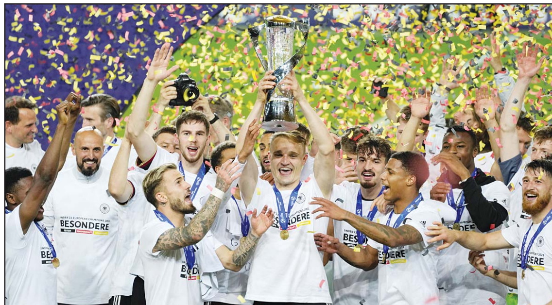
The Germany team celebrate as Germany's Amos Pieper holds the trophy aloft after the Euro U-21 final soccer match between Germany and Portugal at the Stozice stadium in Ljubljana, Slovenia. Germany won the match 1-0.

Portugal defends their title in the postponed Euro 2020 tournament that starts Friday, and will play Germany in a Group F match in Munich on June 19.