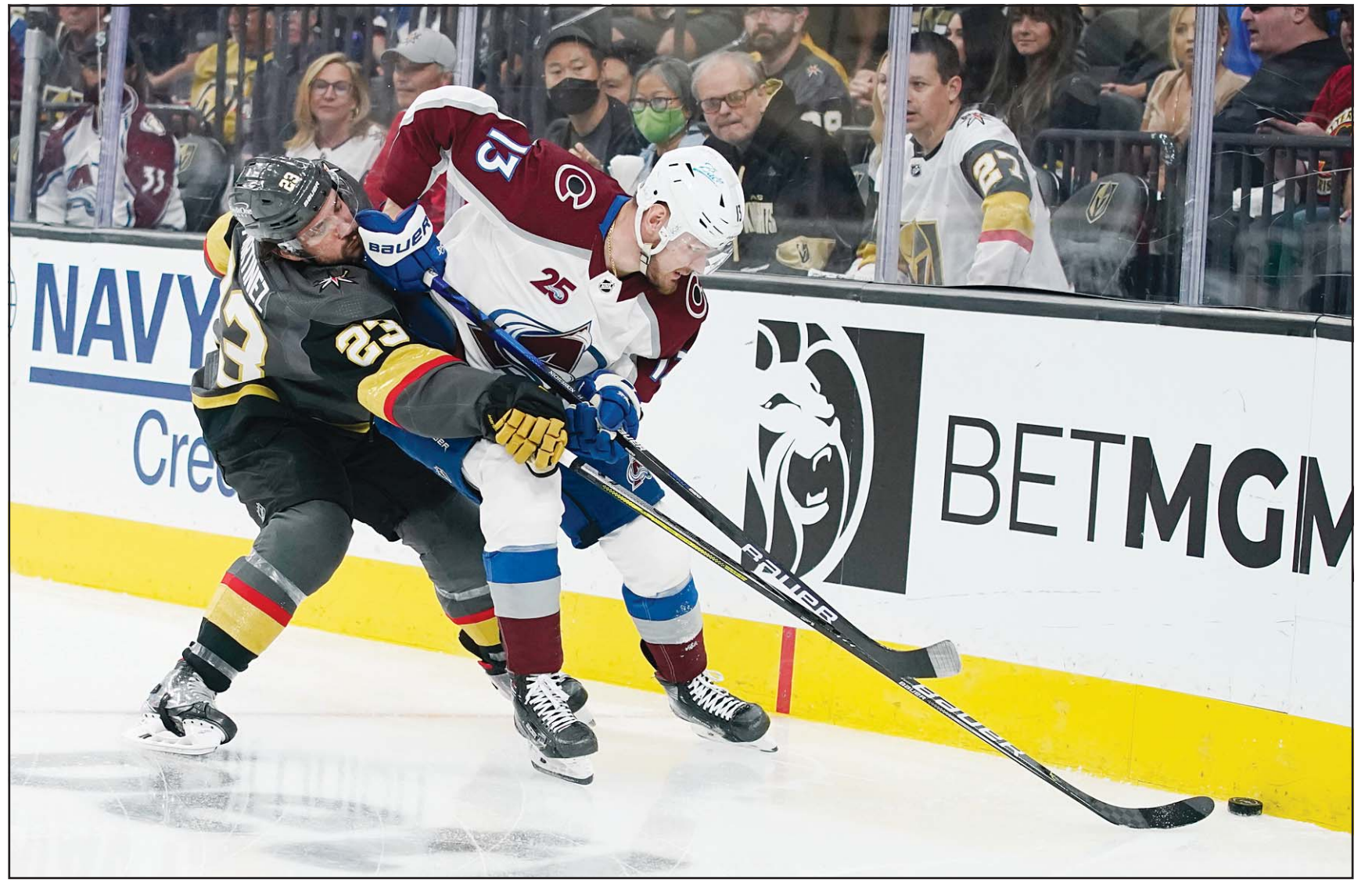
Vegas Golden Knights defenseman Alec Martinez (23) and Colorado Avalanche right wing Valeri Nichushkin (13) vie for the puck during the first period in Game 4 of an NHL hockey Stanley Cup second-round playoff series, on June 6, in Las Vegas.

LAS VEGAS, June 7, Jonathan Marchessault had his fourth career hat trick to lead the Vegas Golden Knights to a 5-1 victory over the Colorado Avalanche to tie their second-round series at two games apiece.