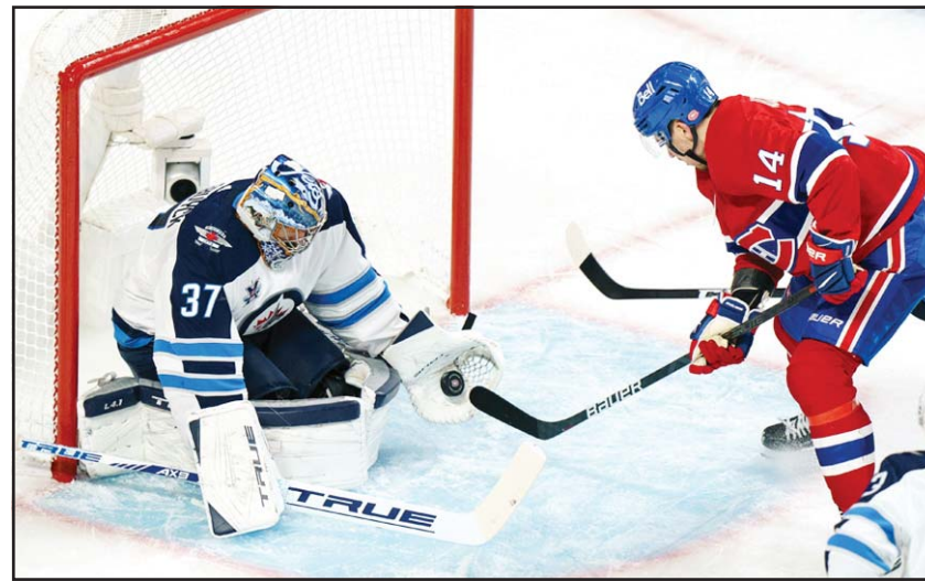
Winnipeg Jets goaltender Connor Hellebuyck makes a glove save off Montreal Canadiens' Nick Suzuki during the second period of an NHL Stanley Cup playoff hockey game in Montreal, on June 6.

playoff save percentage, stopped 30 shots.