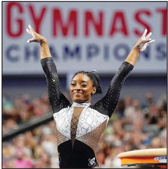
Simone Biles celebrates after competing in the vault during the U.S. Gymnastics Championships, on June 6, in Fort Worth, Texas.