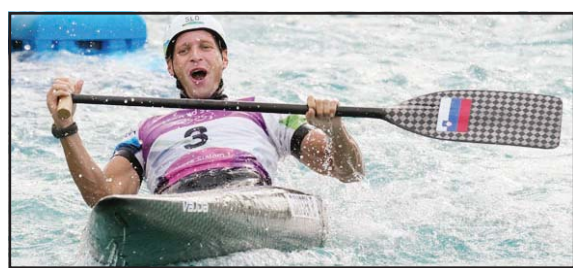
Benjamin Savsek of Slovenia celebrates as he crosses the finish line to win gold medal in the Men's C1 of the Canoe Slalom at the 2020 Summer Olympics in Tokyo, Japan.