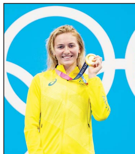
Ariarne Titmus, of Australia holds up her medal after winning the final of the women's 400-meters freestyle at the 2020 Summer Olympics in Tokyo, Japan.

was gold for Lee Lai Shan in women's windsurfing in 1996.