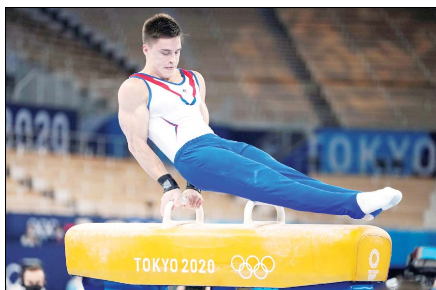
Nikita Nagornyy, of the Russian Olympic Committee, performs on the pommel horse during the artistic gymnastic men's team final at the 2020 Summer Olympics in Tokyo.