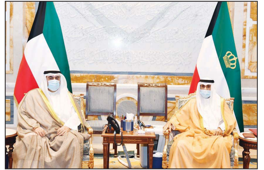
HH the Amir (right), with the Chairman of the Municipal Council Osama Al-Otaibi.

The KOC also intends to float a tender to provide operation and maintenance services for mechanical equipment and air cooling systems at the Al-Ahmadi Hospital, as well as another contract to provide comprehensive maintenance and support services for production facilities in western Kuwait.