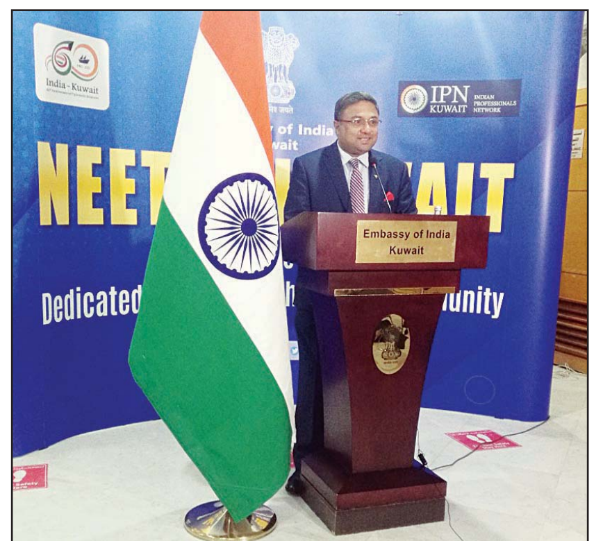
Indian Ambassador speaking at the event.

try's National Day. His Highness the Crown Prince Sheikh Meshaal Al-Ahmad Al-Jaber Al-Sabah and His Highness the Prime Minister Sheikh Sabah Khaled Al-Hamad Al-Sabah sent similar cables.