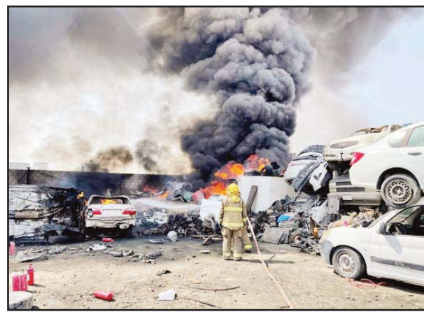
Firemen tackle the blaze at Al-Na'eam scrapyard.

The plant's capacity reaches 400,000 cubic meters of water per day. The project also includes the design and construction of a main electrical transfer station to produce 16 megawatts, and the design and construction of a control and distribution system for treated water which will include a treated water control center.