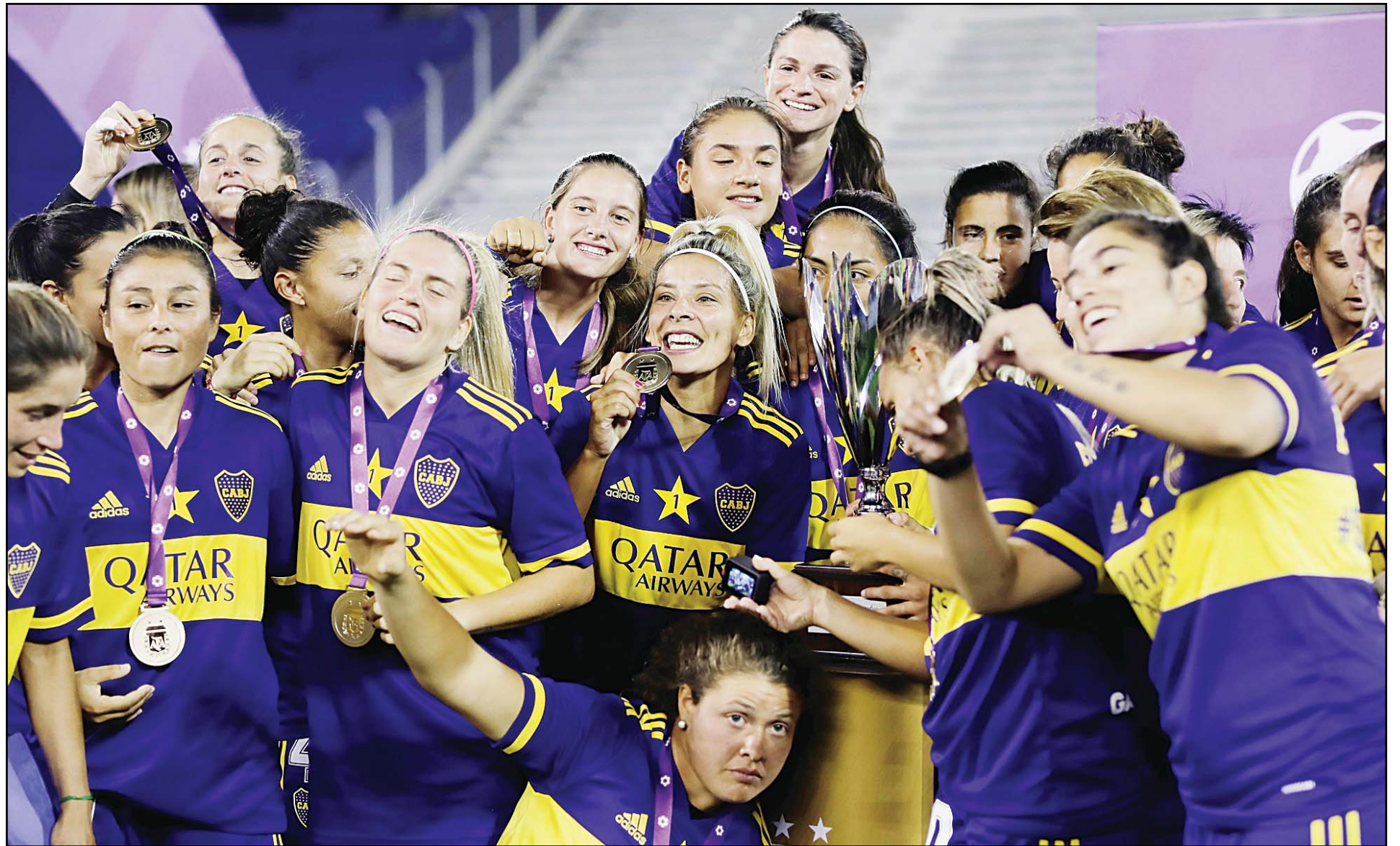
Boca Juniors' players hold the trophy and their medals as they celebrate winning Argentina's soccer female league championship after defeating River 7-0, at Jose Amalfitani Stadium in Buenos Aires, Argentina, Jan 19.