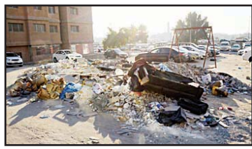
Above: some of the areas where garbage and other used things are dumped.

The general view of many streets and surroundings in Mahboula takes a passerby by surprise, because the atmosphere is depressing and continues to cast a shadow over the people living in the region in light of the continuous repercussions pandemic and the loss of livelihood by many residents.