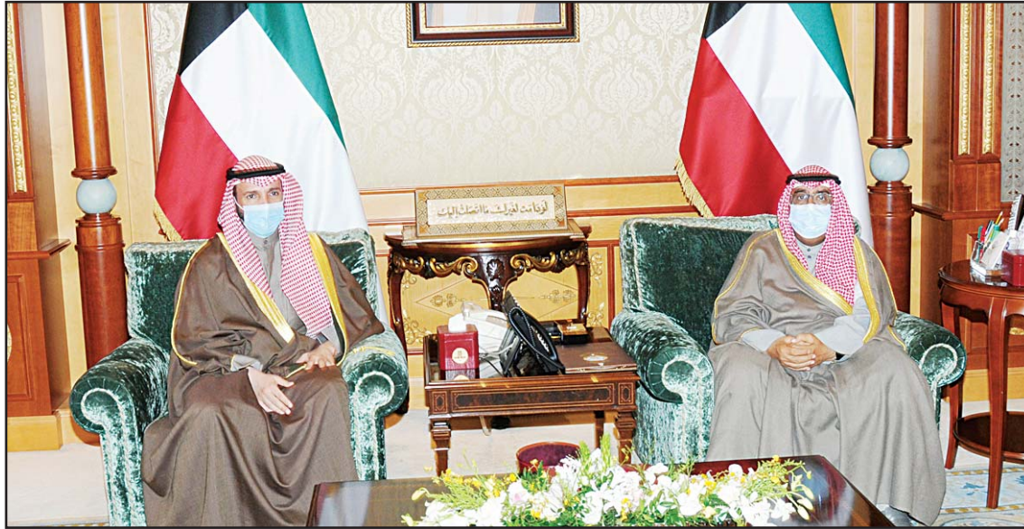
His Highness the Crown Prince Sheikh Meshaal Al-Ahmad Al-Jaber Al-Sabah received at Bayan Palace, Wednesday, National Assembly Speaker Marzouq Ali Al-Ghanim (above). His Highness the Crown Prince also received at Bayan Palace, His Highness the Prime Minister Sheikh Sabah Al-Khaled Al-Sabah.

'Teachers still waiting for this decision to be sanctioned by CSC'