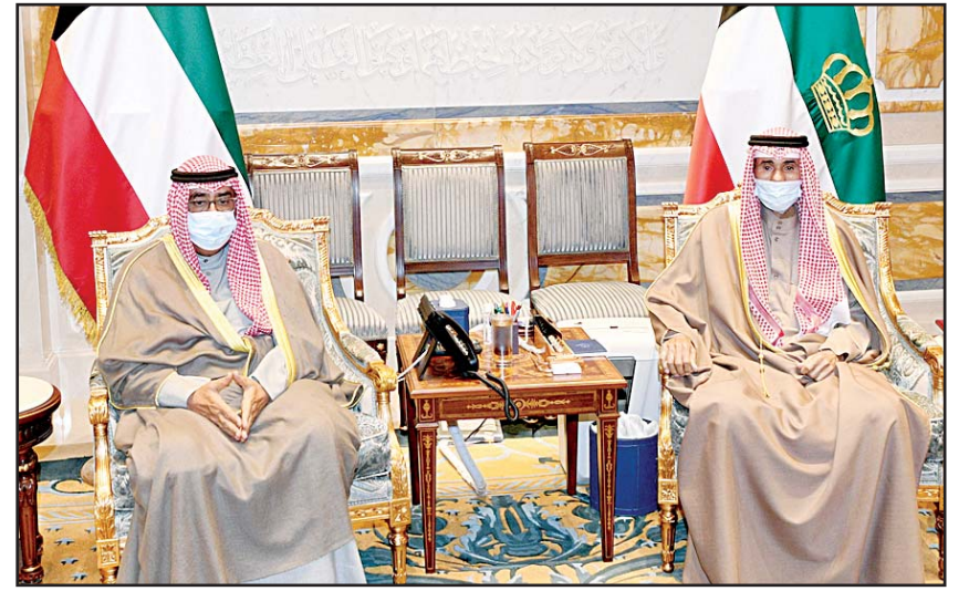
HH the Amir with HH the Crown Prince.