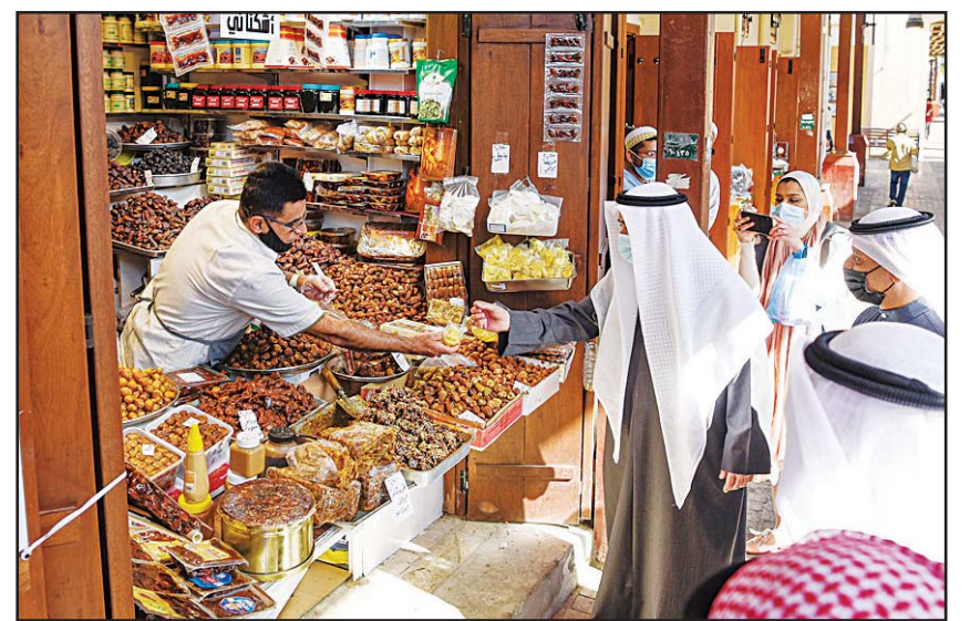
NCCAL's Sec-Gen Kamel Al-Jalil visits one of the shops.

His Highness the Crown Prince Sheikh Meshaal Al-Ahmad Al-Jaber Al-Sabah and His Highness the Prime Minister Sheikh Sabah Khaled Al-Sabah sent similar cables.