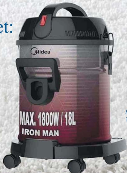
MIDEA VACUUM CLEANER 1800 W IRON MAN

Join us on Telegram www.arabtimesonline.com