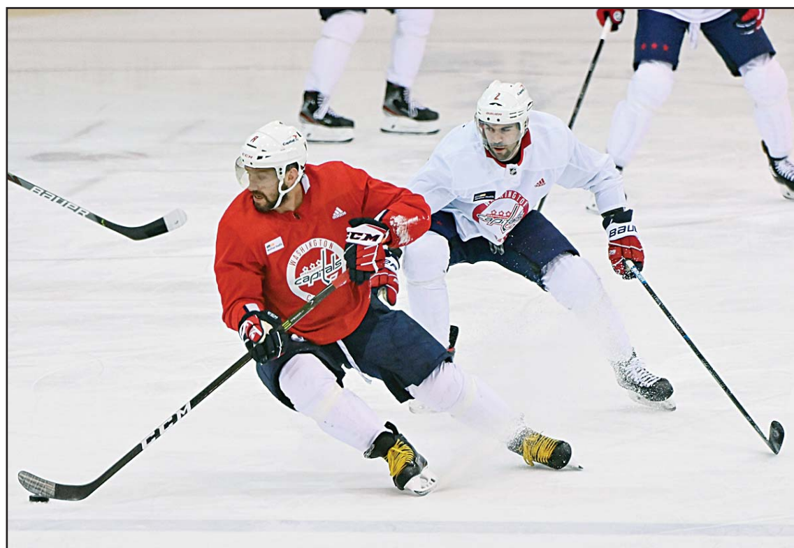
Washington Capitals left wing Alex Ovechkin (8), (foreground), runs a play as defenseman Justin Schultz (2) defends during NHL hockey practice at the MedStar Capitals Iceplex in Arlington, Va, Jan 5.