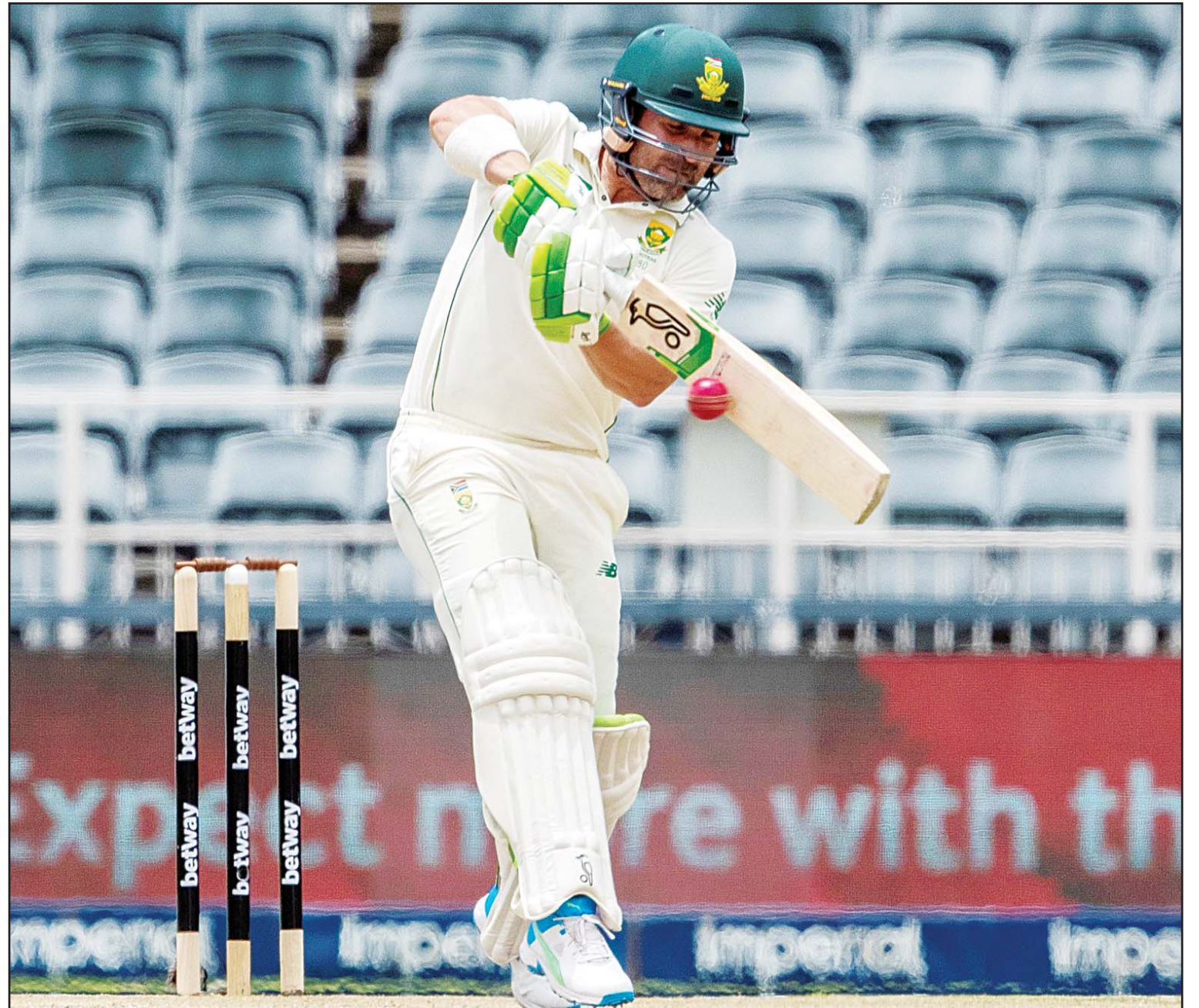
South Africa's Dean Elgar plays a shot during play on the third day of the second cricket Test match between South Africa and Sri Lanka at Wanderers Stadium in Johannesburg, South Africa, Jan 5.

England's players were hosed down with disinfectant spray after disembarking their charter flight, before being kept in 48-hour solitary quarantine in a hotel. They will undergo testing for a second time on Tuesday, with plans to begin training having been delayed until Wednesday at the earliest.