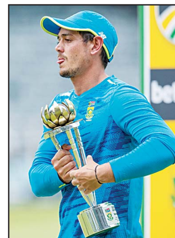
South Africa's captain Quinton de Kock speaks during the post match interview as he holds the trophy for winning the series at the end of play on the third day of the second cricket Test match between South Africa and Sri Lanka at Wanderers stadium in Johannesburg, South Africa, Tuesday, Jan 5, 2021. South Africa beat Sri Lanka by 10 wickets.

of those players were ruled out of the second test. That left the bowling attack especially depleted and Vishwa Fernando, who took five in the first innings, was the attack's most experienced member with just nine test appearances coming into the game.