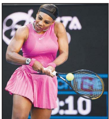
United States' Serena Williams makes a backhand return to Bulgaria's Tsvetana Pironkova during a tuneup event ahead of the Australian Open tennis championships in Melbourne, Australia, on Feb 3.

On the bottom half of the draw, defending Australian Open champion