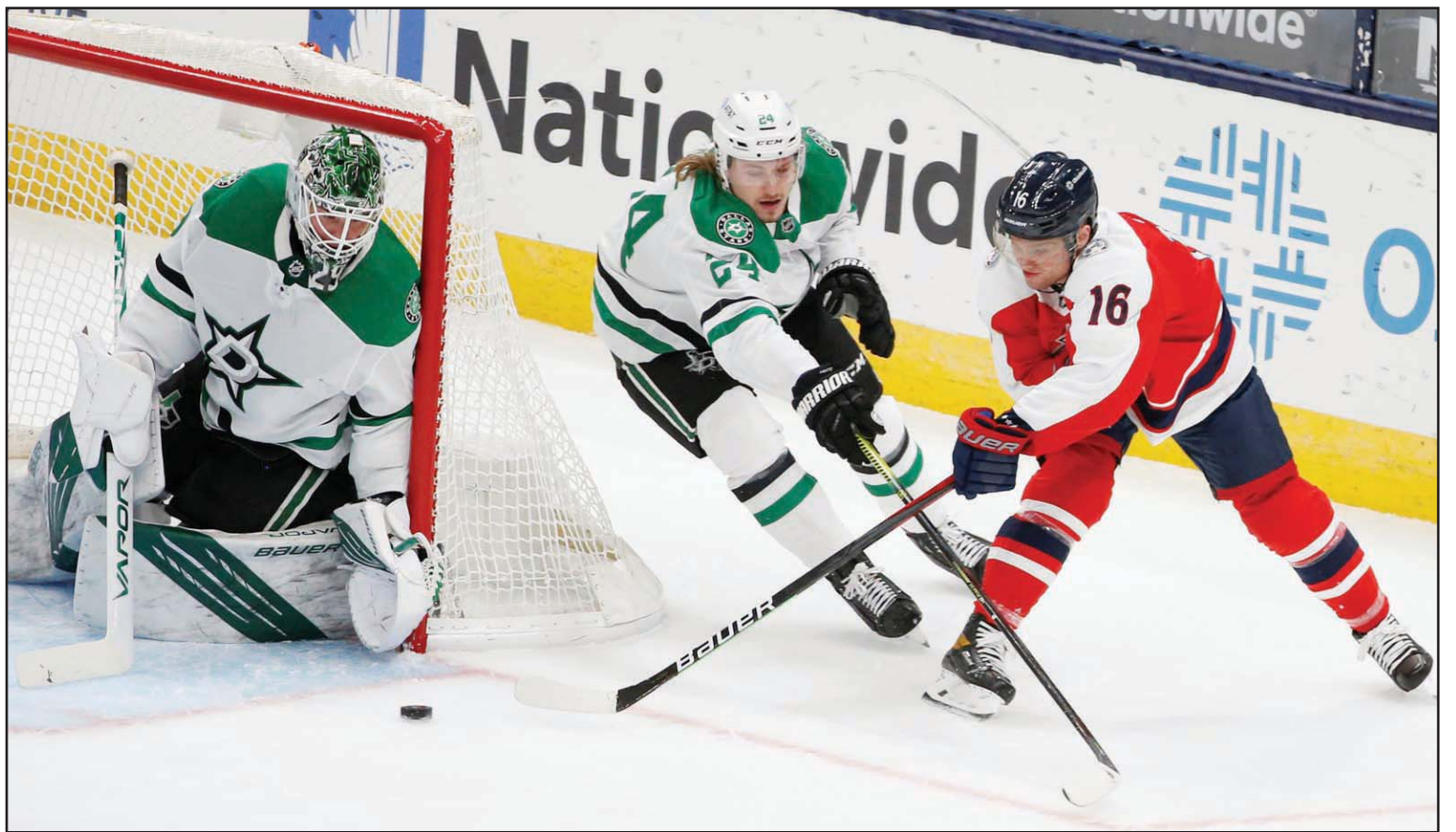
Columbus Blue Jackets' Max Domi, (right), shoots on Dallas Stars' Jake Oettinger, (left), as Roope Hintz defends during the second period of an NHL hockey game, on Feb 2, in Columbus, Ohio.