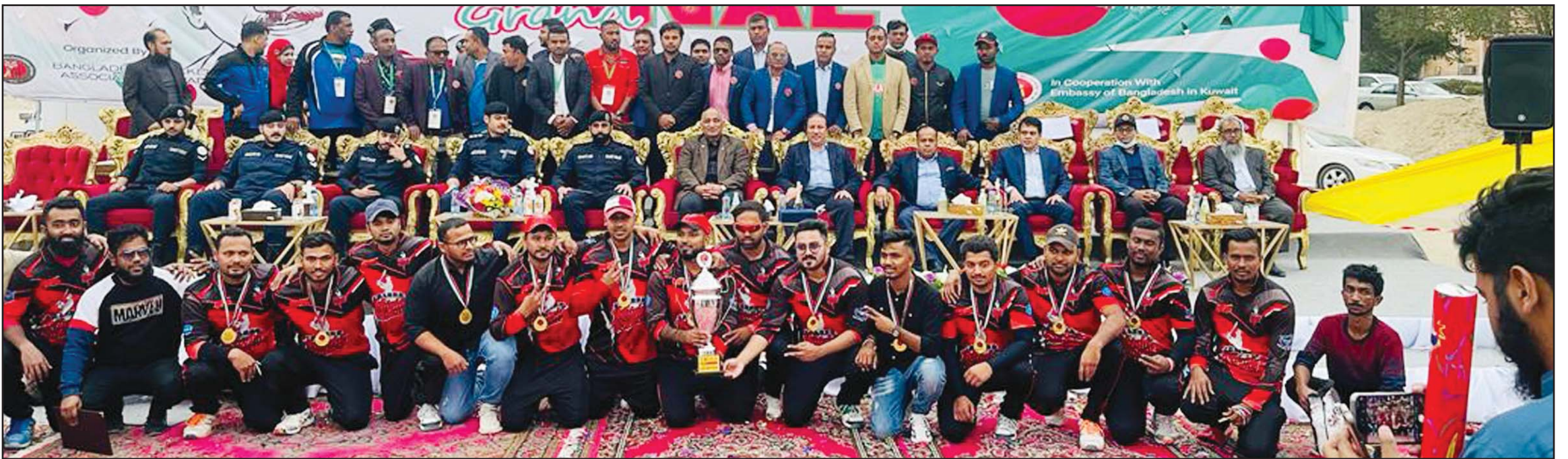
A group photo from the Mujib Borsho Victory Day Cricket Tournament 2021.