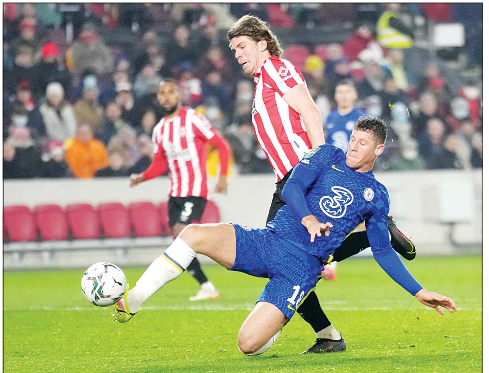
Chelsea's Ross Barkley, (right), challenges for the ball with Brentford's Mads Bech Sorensen during the English League Cup quarterfinal soccer match between Brentford and Chelsea at Brentford Community Stadium in London.

West Ham are set to be without Michail Antonio after he tested positive for coronavirus. Aaron Cresswell (ribs) remains doubtful while Vladimir Coufal serves a one-game ban for his recent dismissal at Arsenal. Southampton manager Ralph Hasenhuttl has a decision to make over his goalkeeper after Fraser Forster returned to training, with Willy Caballero deputizing in the last two games. Stuart Armstrong, Che Adams and Adam Armstrong have recovered from recent injuries so are back in contention.