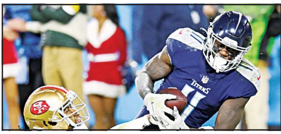
Tennessee Titans wide receiver A.J. Brown (11) catches a touchdown pass as he is defended by San Francisco 49ers cornerback Josh Norman, (left), in the second half of an NFL football game in Nashville, Tenn. Titans won 20-17.