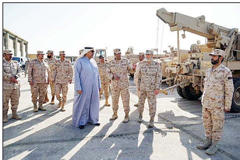
The Minister of Defense Sheikh Hamad Jaber Al-Ali Al-Sabah reviews the equipment of the Sixth Automated Liberation Brigade.

We will continue to deepen our partnership on the issues we've worked on together for many years. And we will broaden our partnership to new fields of endeavor because we want to be active together wherever we can deliver greater security, prosperity, and well-being for people in Kuwait, the United States, and around the world.