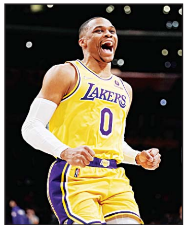
Los Angeles Lakers' Russell Westbrook shouts to fans before the team's NBA basketball game against the Phoenix Suns on Dec 21, in Los Angeles.

LeBron James scored 34 points for the Lakers, who lost their third game in a row as coach Frank Vogel remained in health and safety protocols for the