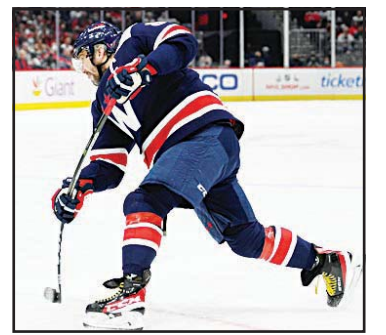
Washington Capitals left wing Alex Ovechkin (8) shoots the puck during the first period of an NHL hockey game against the Columbus Blue Jackets on Dec 4, in Washington.

Predators 4, Canadiens 3, OT In Nashville, Tenn., Filip Forsberg