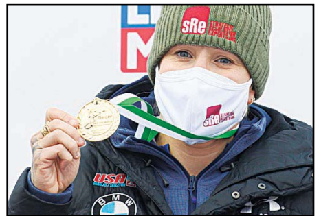
Canada's Kaillie Humphries of the United States holds the gold medal on the podium after her victory in the women's monobob race at the World Cup in Altenberg, Germany, on Dec.4.

Note: Two points for a win one point for overtime loss. Top three teams in each division and two wild cards per conference advance to playoffs.