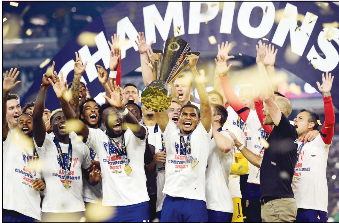
United States celebrate their extra-time victory over Mexico in the CONCACAF Gold Cup final soccer match on Aug. 1, in Las Vegas.