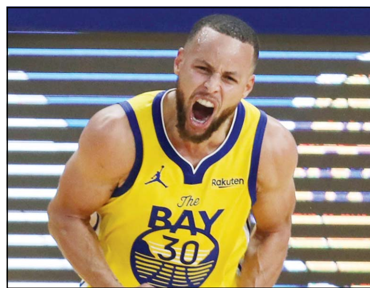
Golden State Warriors' Stephen Curry (30) yells at a referee during the second half of the team's NBA basketball game against the Denver Nuggets in San Francisco.