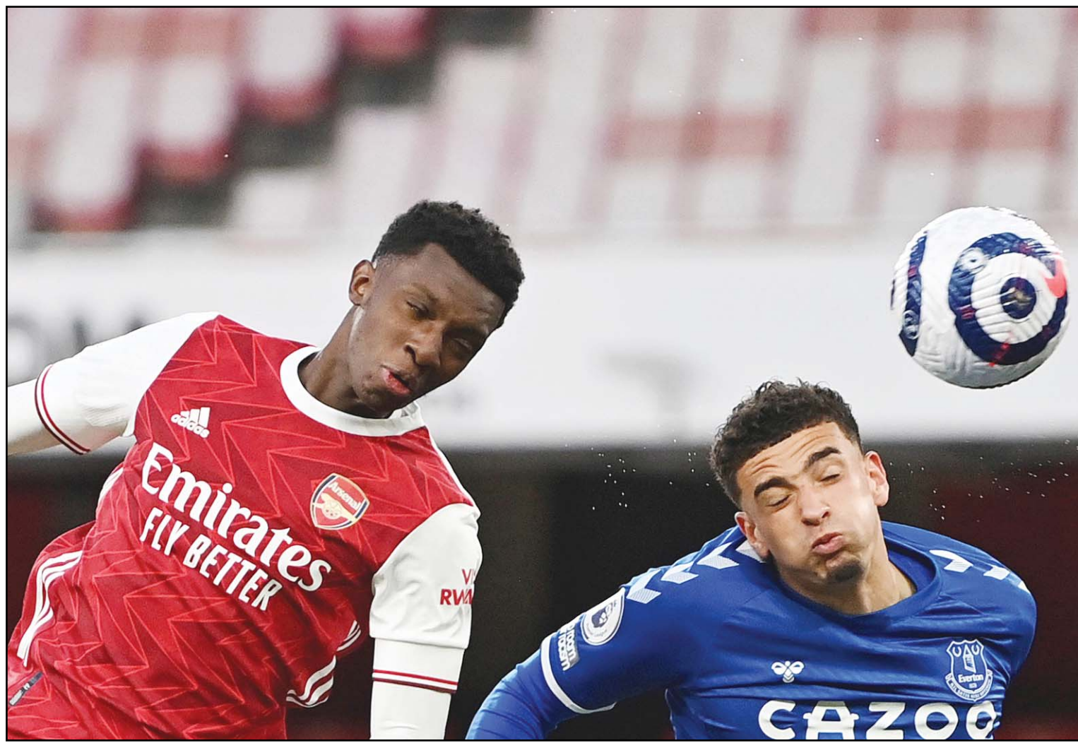
Arsenal's Eddie Nketiah (left), duels for the ball with Everton's Ben Godfrey during the English Premier League soccer match between Arsenal and Everton at the Emirates stadium in London.

The 30-nation European Leagues group believes a separate UEFA path to driving Champions League changes, the Club Competitions' Committee, cannot continue with ECA having 80% of the seats.