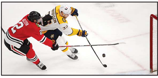
Chicago Blackhawks defenseman Duncan Keith (2) knocks away the puck from Nashville Predators right wing Viktor Arvidsson (33) during the third period of an NHL hockey game in Chicago. Predators won 3-1.— See Page 14