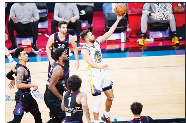
Golden State Warriors' Stephen Curry, (right), goes for a shot during the first half of an NBA basketball game against the Philadelphia 76ers in Philadelphia.

Collin Sexton scored 28 points and Darius Garland added 23 for the Cavaliers. The backcourt scored the final 20 points for Cleveland, which is fading in the race for the play-in tournament in the Eastern Conference.