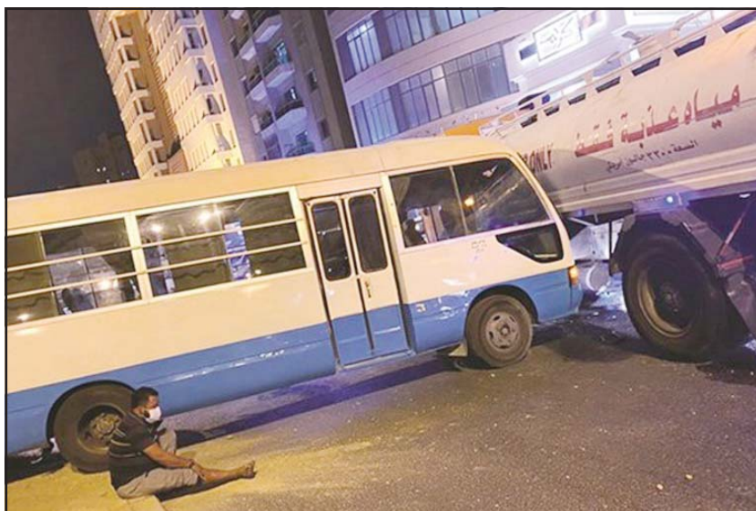
Scene of the accident.

The suspects were caught by police during a security tour in Hawalli.