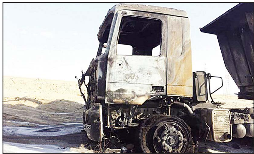
The trailer truck completely destroyed by fire.

The daily added, this happened after the Operations Room of the Ministry of Interior received a report that some sea goers had found a jet ski, but no one was seen around it.