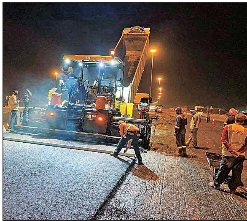
Maintenance works of one of the roads.