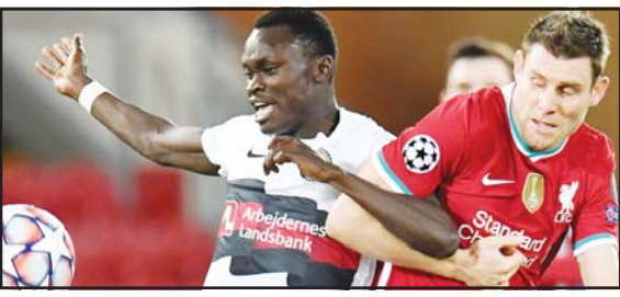
Liverpool's James Milner (right) and Midtjylland's Pione Sisto lock arms during the Champions League Group D soccer match between Liverpool and FC Midtjylland at Anfield stadium in Liverpool, England on Oct 27.