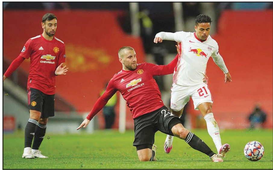
Leipzig's Justin Kluivert (right), is challenged by Manchester United's Luke Shaw during the Champions League Group H soccer match between Manchester United and RB Leipzig, at the Old Trafford stadium in Manchester, England on Oct 28.

BERLIN, Oct 29, — Leipzig were still celebrating their swift ascent from the lower divisions of German soccer when Manchester United handed the club the biggest loss in their 11-year history.