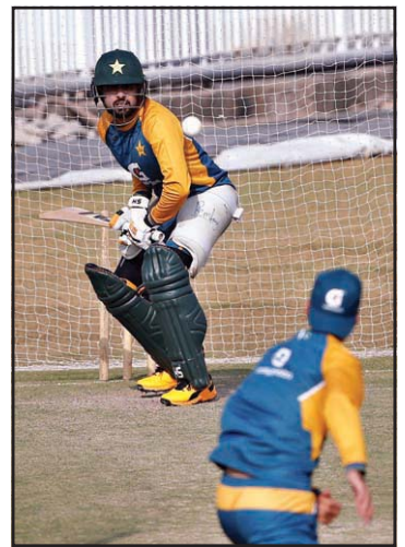
Pakistan cricket team skipper Babar Azam bats during a practice session at the Pindi Cricket Stadium in Rawalpindi, Pakistan on Oct 29.

Australia squad: Aaron Finch (captain), Sean Abbott, Ashton Agar, Alex Carey, Pat Cummins, Cameron Green, Josh Hazlewood, Moises Henriques, Marnus Labuschagne, Glenn Maxwell, Daniel Sams, Kane Richardson, Steven Smith, Mitchell Starc, Marcus Stoinis, Matthew Wade, David Warner, Adam Zampa