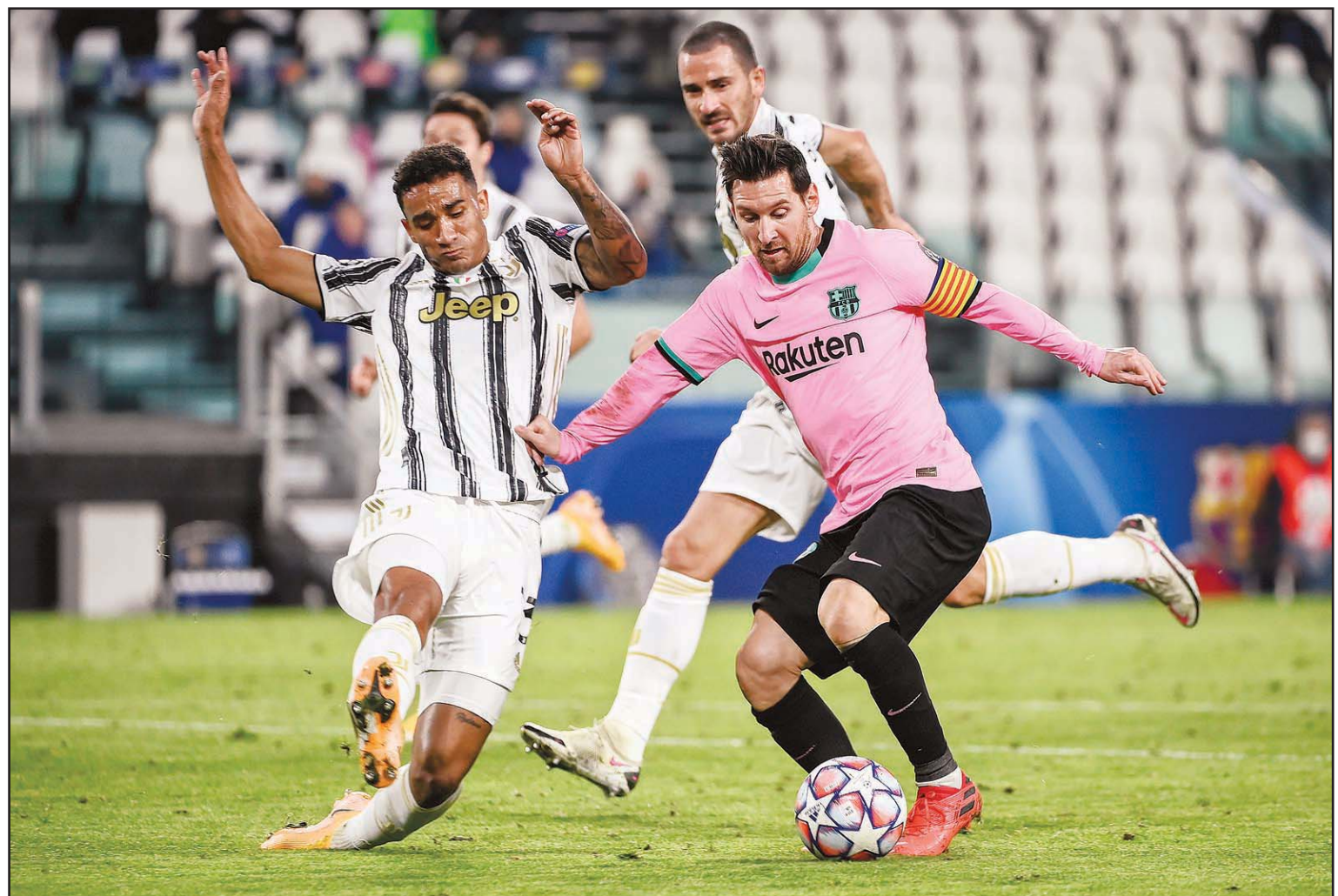
Lionel Messi of FC Barcelona (right) and Danilo of Juventus FC vie for the ball during a group stage soccer match of UEFA Champions League in Turin, Italy on Oct 28.