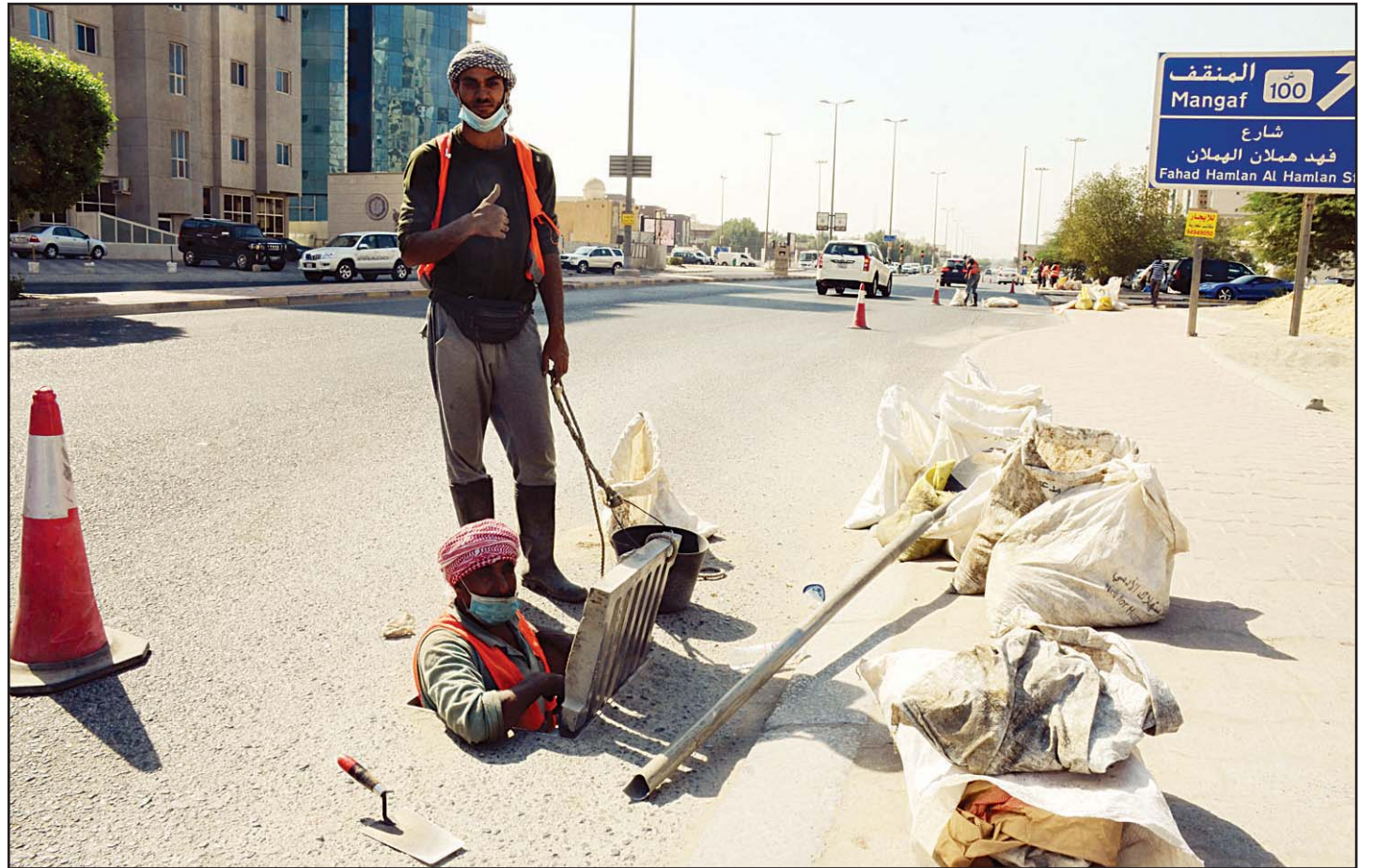
Municipality workers toil to clean the drains before the onset of the rainy season.