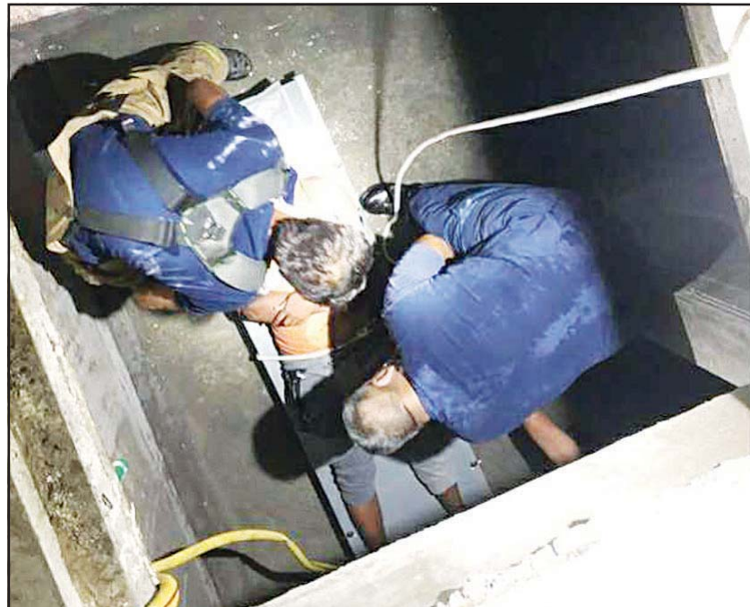
Worker being rescued from engine room.

The crimes for which members of the police force are entitled to a reward varies between state security crimes, alcohol issues, possession and smuggling of narcotic substances, money laundering and terrorist financing crimes, human trafficking and smuggling labor into the country (visa trading).