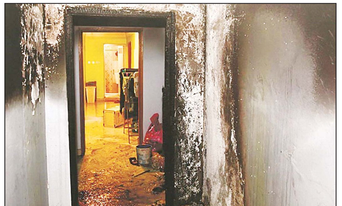
Some of the damage caused by the fire.

About 680,262 domestic workers of Asian and African nationalities