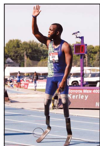
In this July 27, 2019 file photo, Blake Leeper waves to the crowd before the men's 400-meter dash at the US Championships athletics meet in Des Moines, Iowa.

"I will never give up and will continue to do all I can to compete