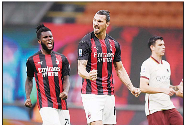
AC Milan's Zlatan Ibrahimovic celebrates scoring his side's third goal during the Serie A soccer match between AC Milan and Roma at the Milan San Siro Stadium in Italy, on Oct 26.

The board also approved a budget for 2020-21 with an operating income of 828 million euros ($982 million) and operating expenses of 796 million euros ($944 million).