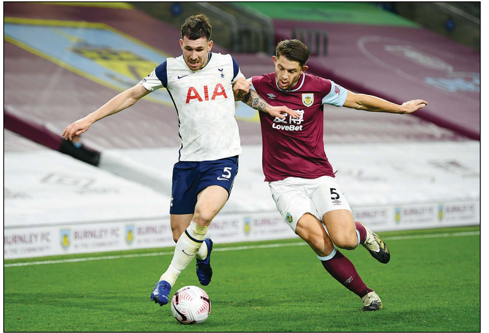
Tottenham's Pierre-Emile Hojbjerg (left), and Burnley's James Tarkowski compete for the ball during the English Premier League soccer match between Burnley and Tottenham Hotspur at Turf Moor stadium Burnley, England on Oct 26.