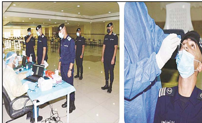
PCR tests conducted at the Saad Al-Abdullah Academy.

"Also, there is a tendency to hold transport companies legally responsible for packaging or transporting supplies abroad, as these materials are forbidden for a Kuwaiti to even take them out of the country", he said.