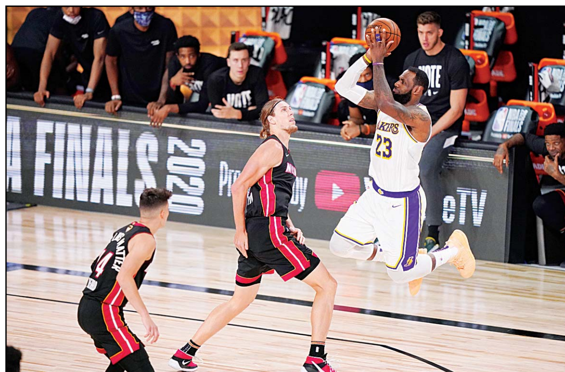
Los Angeles Lakers' LeBron James (23) takes a shot over Miami Heat's Kelly Olynyk (9) during the second half in Game 6 of basketball's NBA Finals on Oct 11, in Lake Buena Vista, Fla.

Russia's Andrey Rublev also made his Top 10 debut Monday, using a second consecutive major quarter-final appearance to go to No. 10 from No. 12.