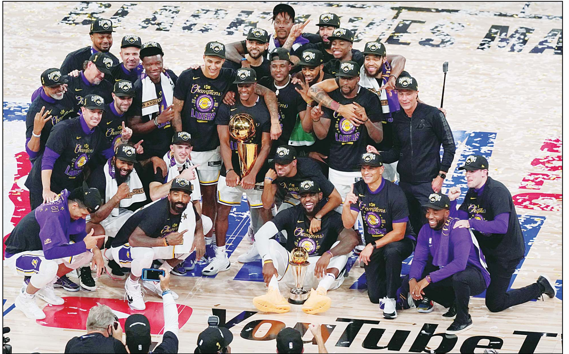
The Los Angeles Lakers players and coaches celebrate after the Lakers defeated the Miami Heat 103-88 in Game 6 of basketball's NBA Finals on Oct 11, in Lake Buena Vista, Fla.