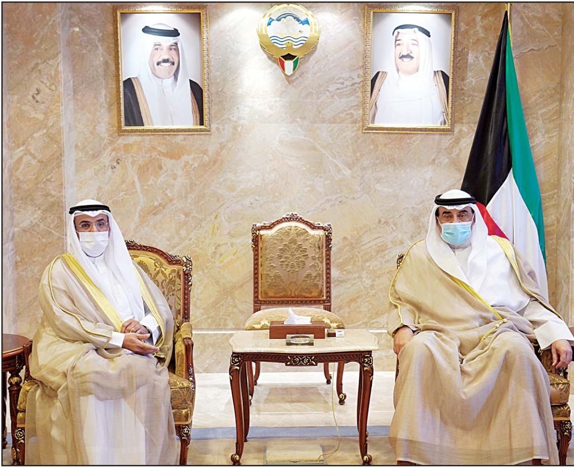
HH the Prime Minister Sheikh Sabah Al-Khaled Al-Sabah receives GCC Secretary-General HE Dr Nayef Falah Al-Hajraf. Various issues were discussed.